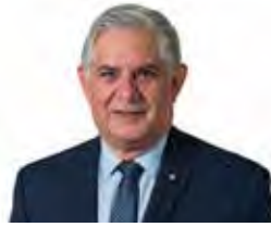
The Hon Ken Wyatt AM, MP