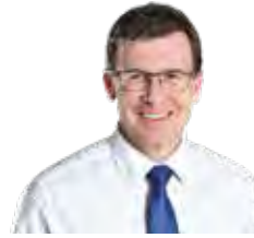
The Hon Alan Tudge MP