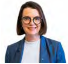
Senator the Hon Anne Ruston