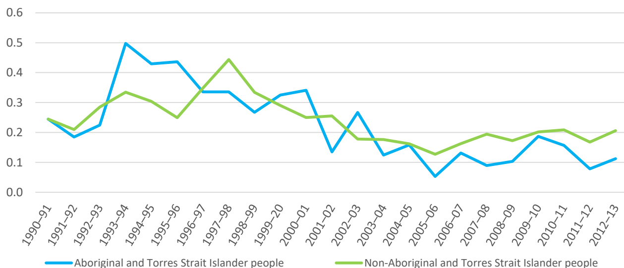
Chart 1.2 Deaths in prison custody by Aboriginal and Torres Strait Islander status (per 100 prisoners)